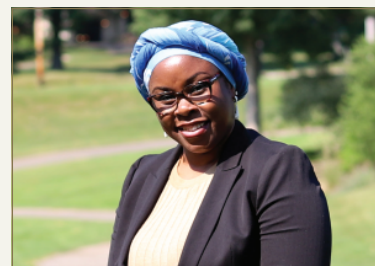
Efewongbe Oleghe Bloomington Internal Medicine