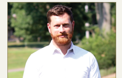
Dallas Robinson Farmers National Bank