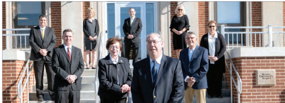
2021 Annual Dinner program Award Recipients