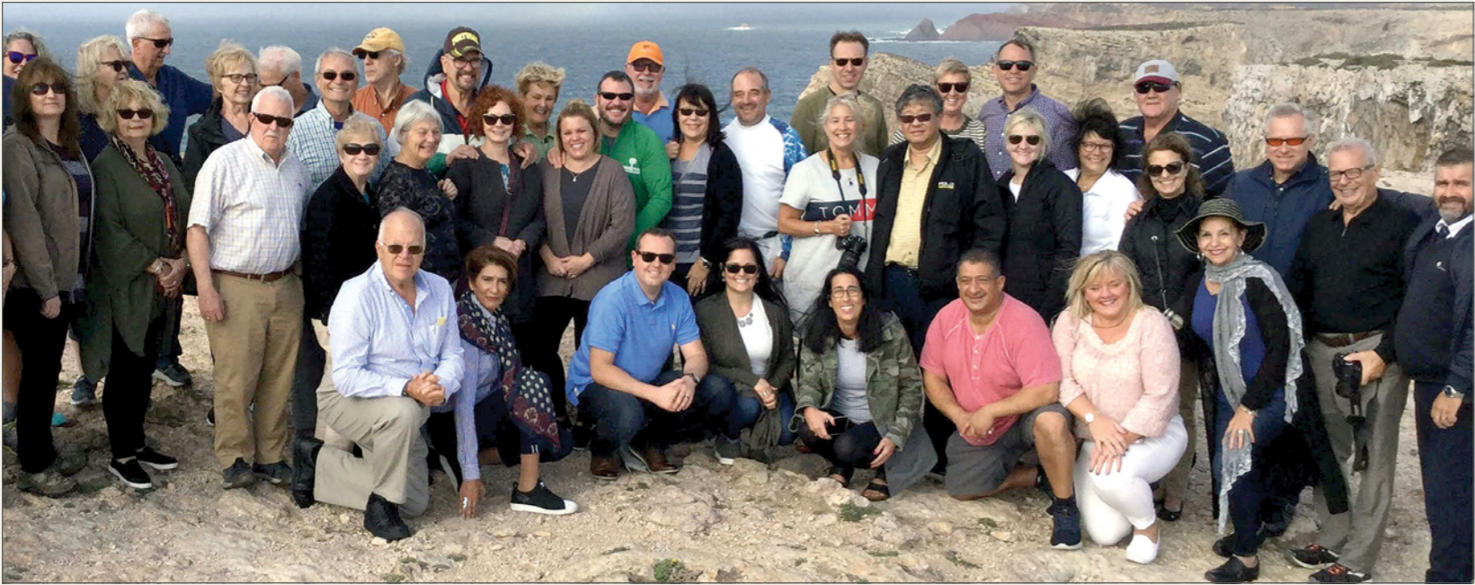
A strong Wooster Chamber contingent of more than thirty enjoying the barren headlanes at Cape St. Vincent in Sagres, Portugal on Sunday, November 3, 2019.

Thirty-four Wooster Chamber and Community Members traveled to beautiful Portugal, on a trip organized by the Wooster Chamber. In the recent past, the Wooster Chamber has extended unique all-inclusive travel opportunities to its members of which strong support has been realized. The contingent that traveled to Portugal from October 29 through November 7, was offered a comprehensive overview of the culture, landscape, and history of the country, all while enjoying the company of fellow Wooster citizens. The trip itinerary included stays in the city center of Cascais, the vast vineyards of Beja, the harbor of Lagos and the main metro of Lisbon. The days were filled with activities ranging from walking tours of various cities to the exploration of the world-famous Fatima area and the majestic sights of the ocean cliffs of Sagres, Portugal.