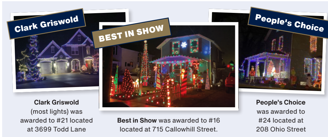
Clark Griswold (most lights) was awarded to #21 located at 3699 Todd Lane