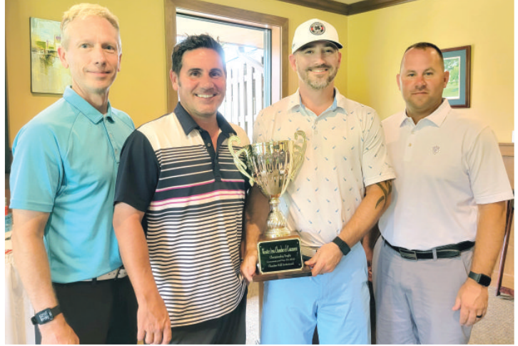
The 2021 Chamber Golf Invitational Champions, Wayne Savings Community Bank