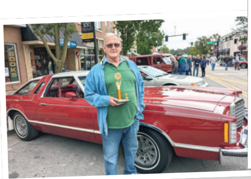
Woosterfest 2022 Cruise-In Winner