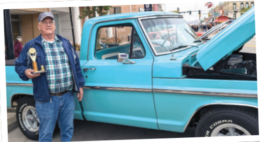
Woosterfest 2022 Cruise-In Winner