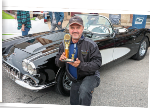
Woosterfest 2022 Cruise-In Winner