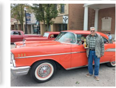
Woosterfest 2022 Cruise-In Winner

Save the Date for the 2023 Woosterfest – Friday, Sept. 29 and Saturday, Sept. 30! Thank you to all of our 2022 Woosterfest event sponsors!