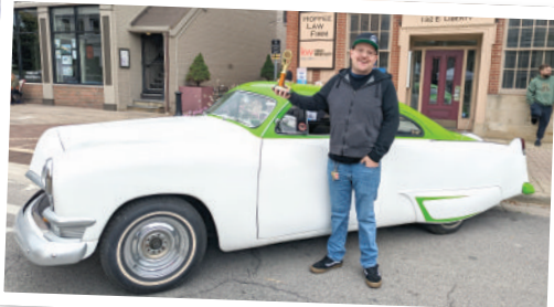
Woosterfest 2022 Cruise-In Winner