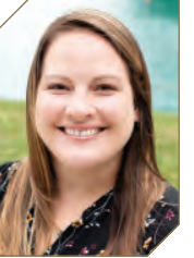
Laurel Harrison Cleveland Road Animal Hospital