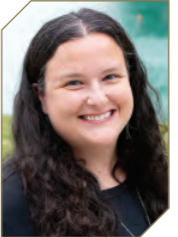
Dee Black Flex Yoga